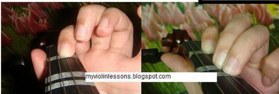
Finger on strings before trimming

Protect your investment and protect your talent!